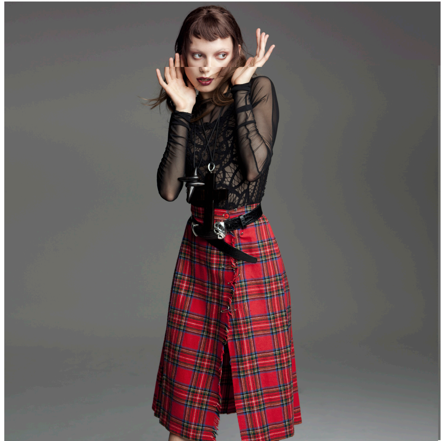
Sheer Top ELEEN HALVORSEN, Lace Top SCREAMING MIMI'S, Skirt SEARCH & DESTORY Necklaces, Belt PATRICIA VON MUSULIN