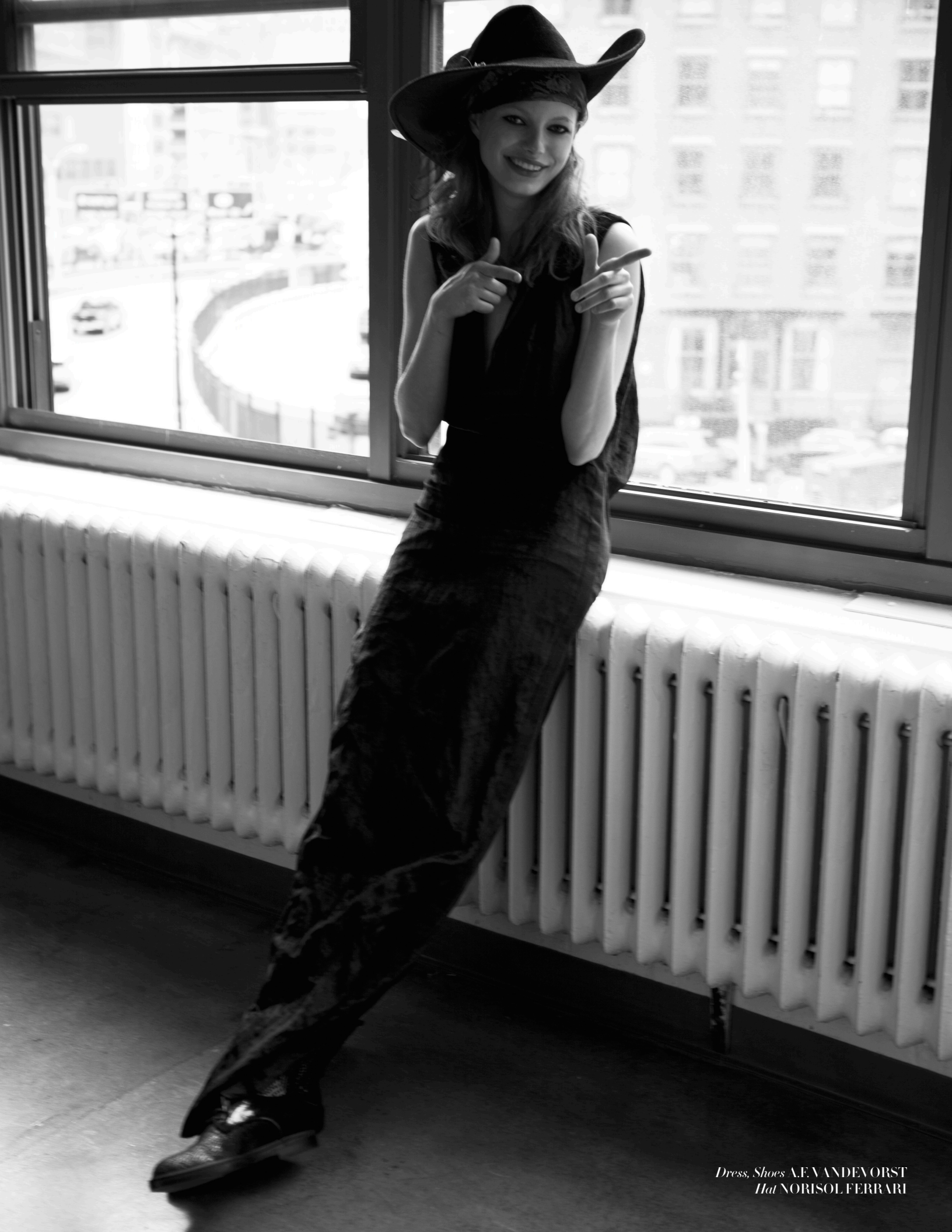
Dress, Shoes A.E. VANDEVORST Hat NORISOL FERRARI