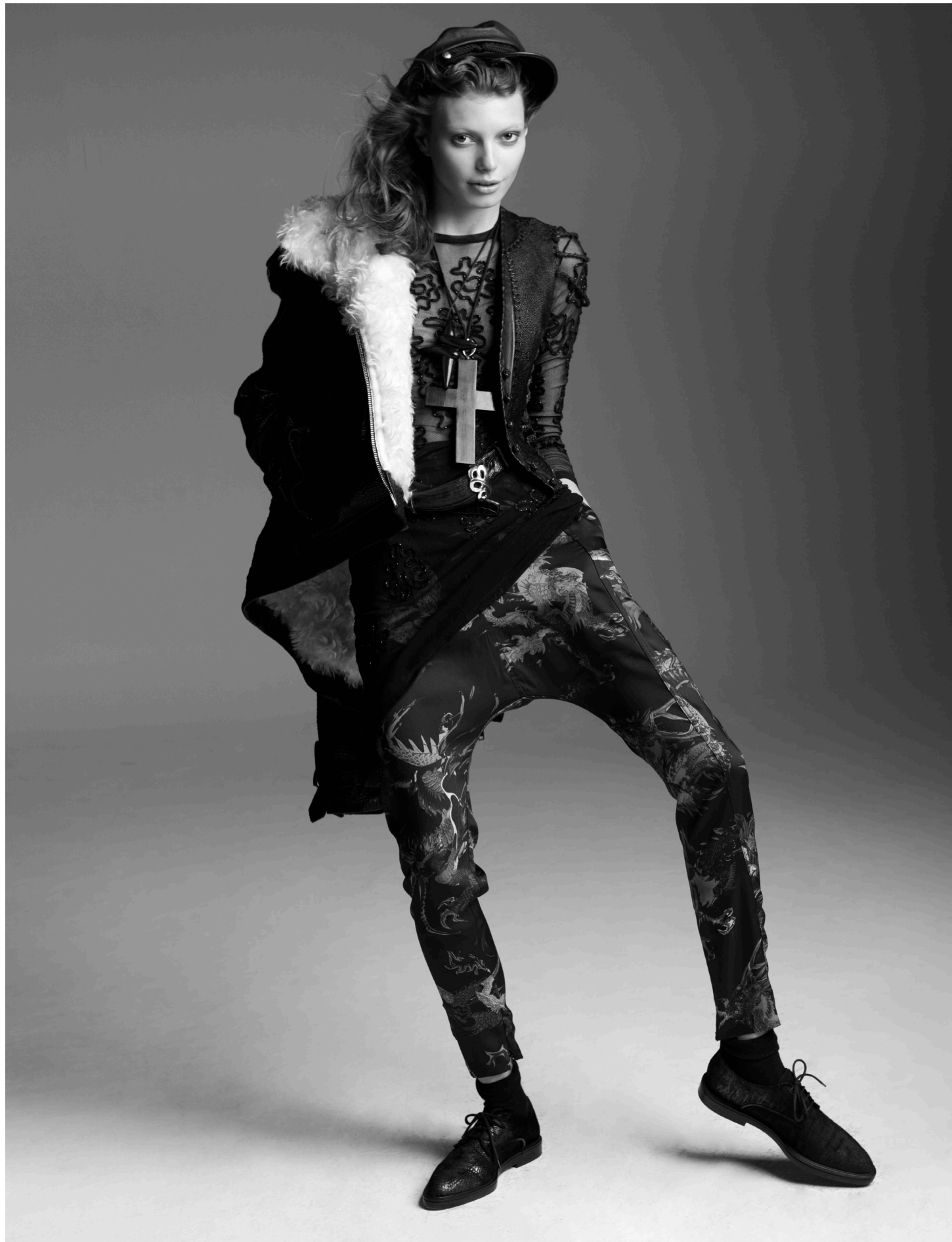
Jacket HOUGHTON, Vest LOST ART, Pants A.FRIEND by A.F. VANDEVORST, Top, Hat SCREAMING MIMI'S Necklaces, Belt PATRICIA VON MUSULIN, Shoes A.F. VANDEVORST