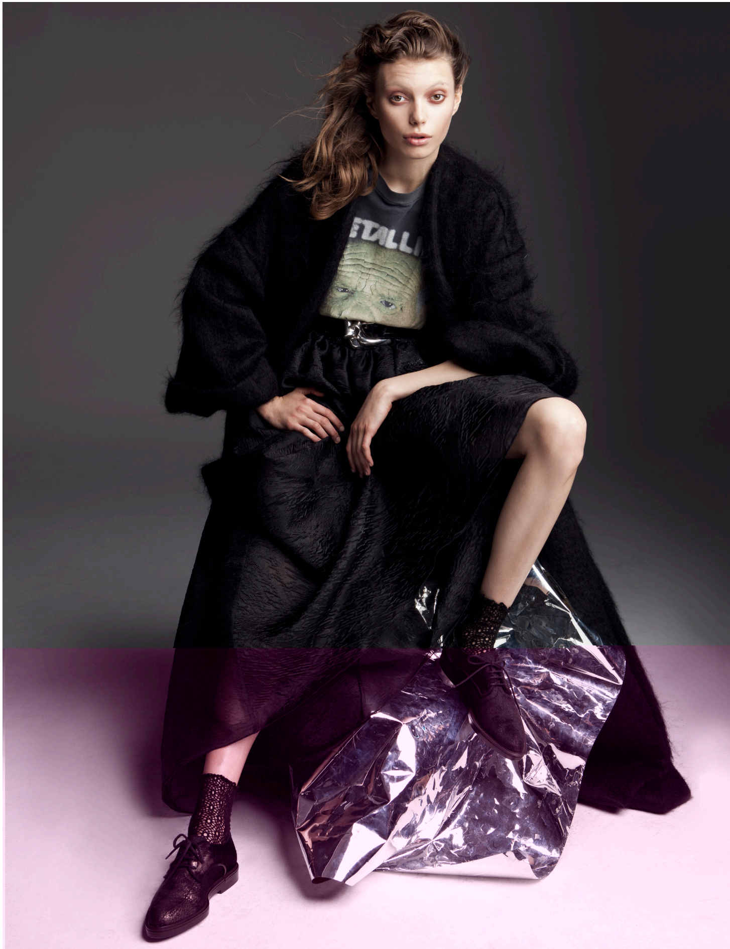
Coat, Skirt HOUGHTON, T-shirt SEARCH & DESTORY, Belt PATRICIA VON MUSULIN Shoes A.F. VANDEVORST