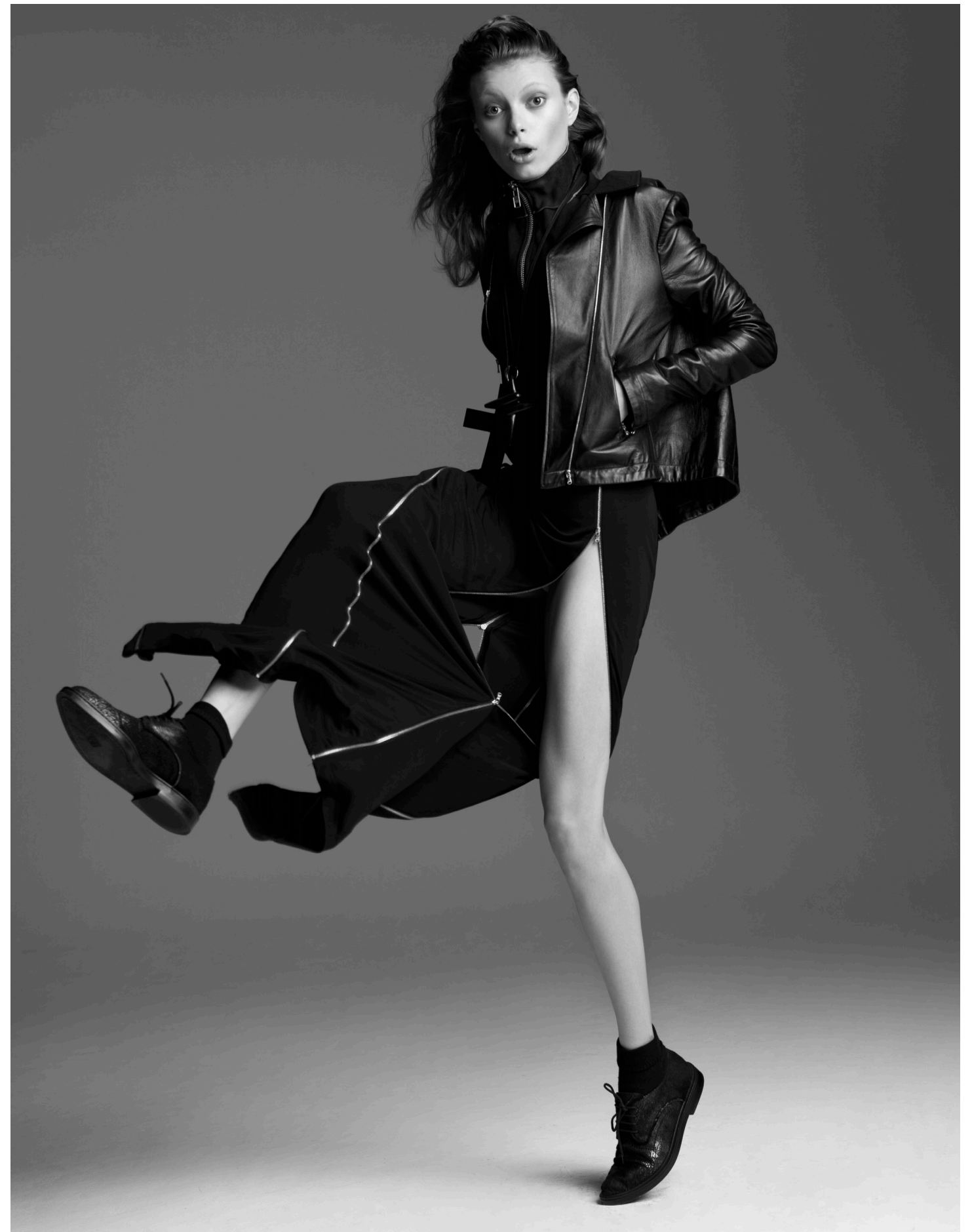
Dress ANTHONY MANFREDONIA, Jacket VEREDA, Zip up Jacket (inside) ODD, Shoes A.E. VANDEVORST, Necklace PATRICIA VON MUSULIN