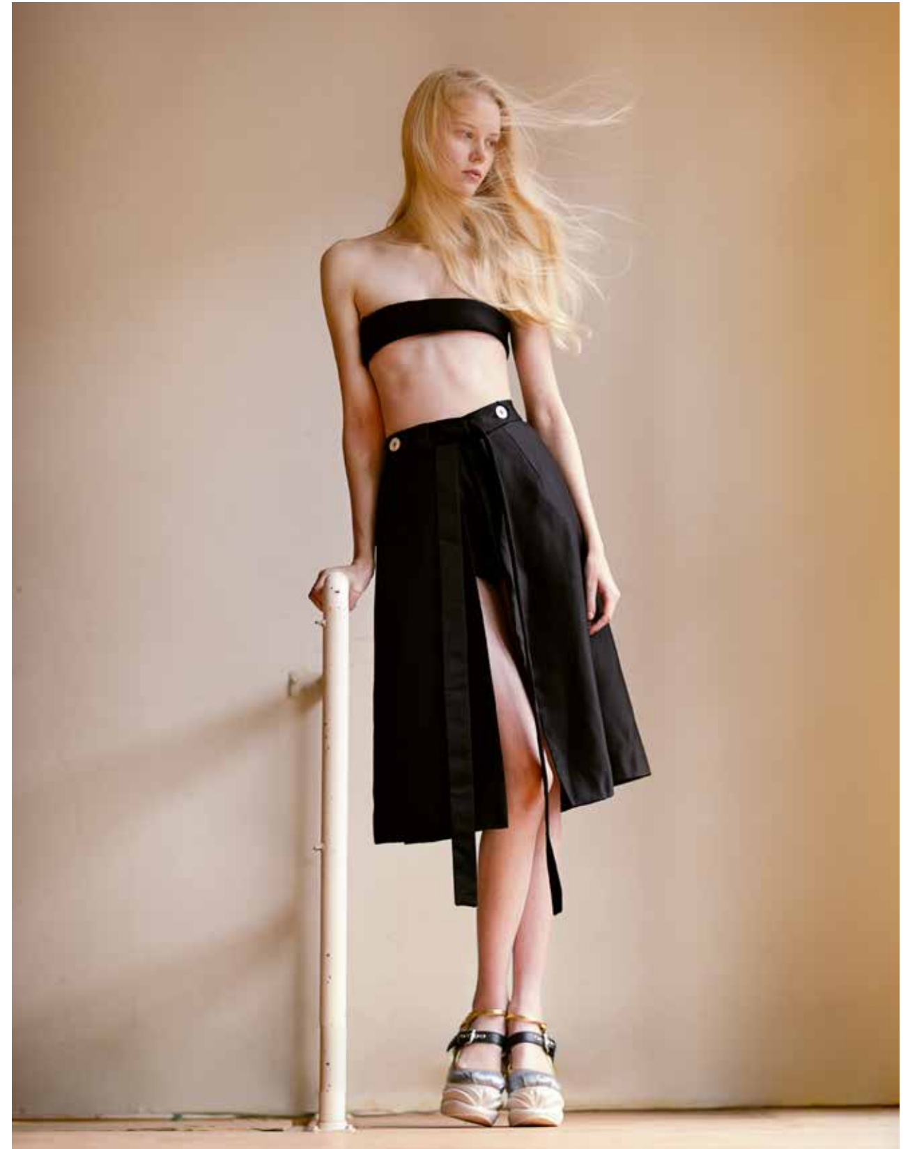
Top, Skirt, Shoes MIU MIU