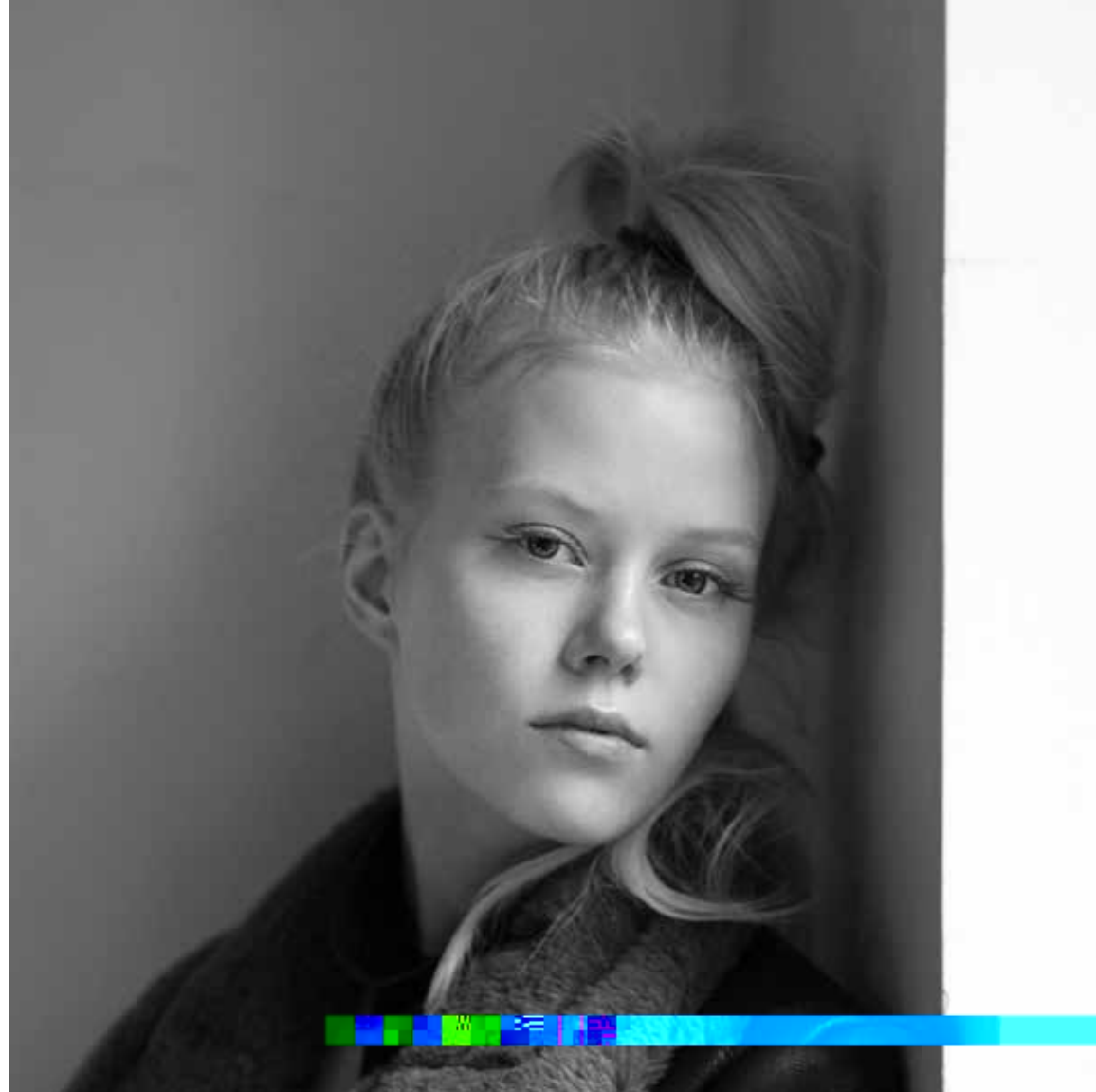
JACKET PIXIE MARKET