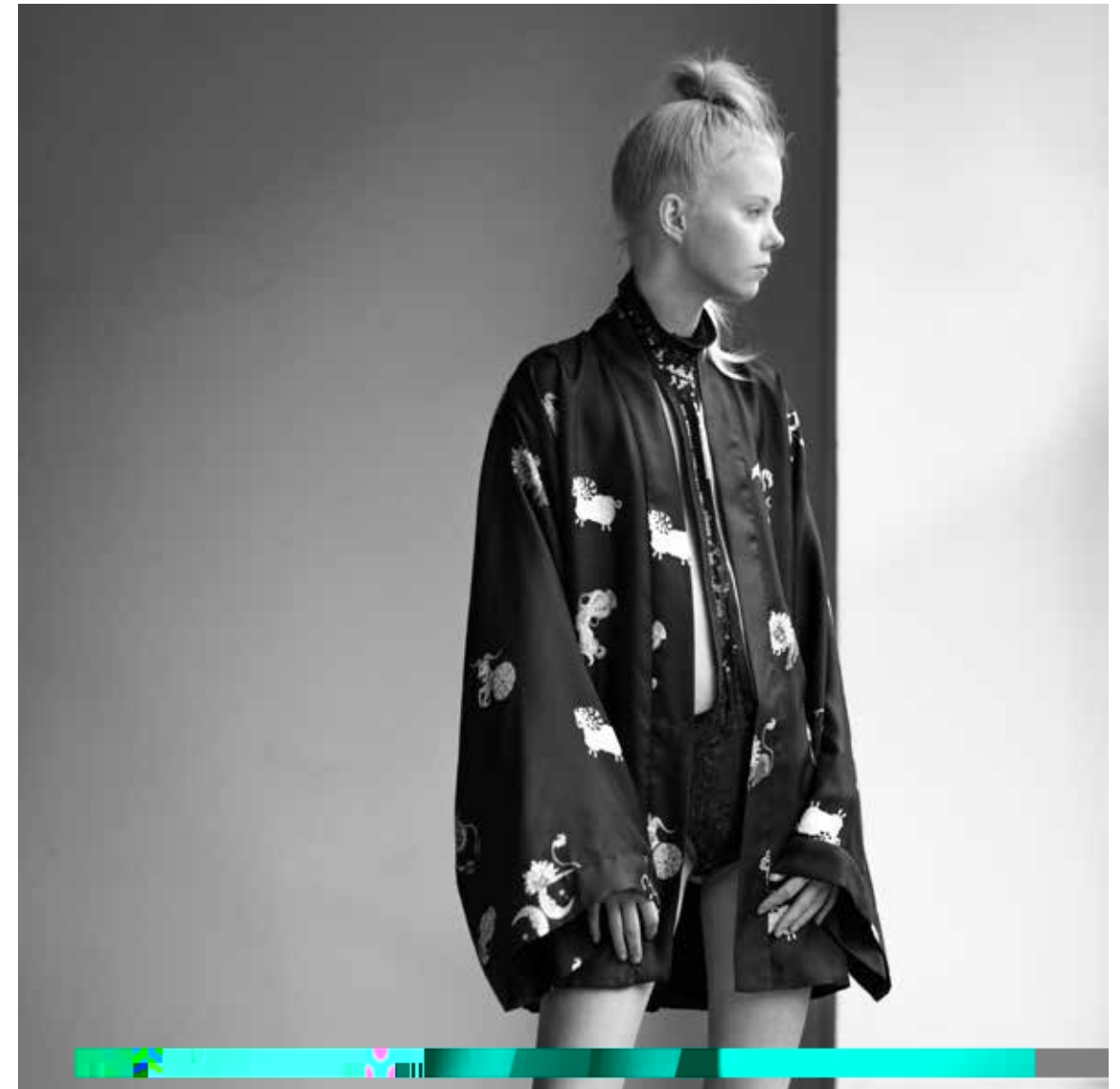
Jacket CYNTHIA ROWLEY, Top CHENG HUAI CHUANG