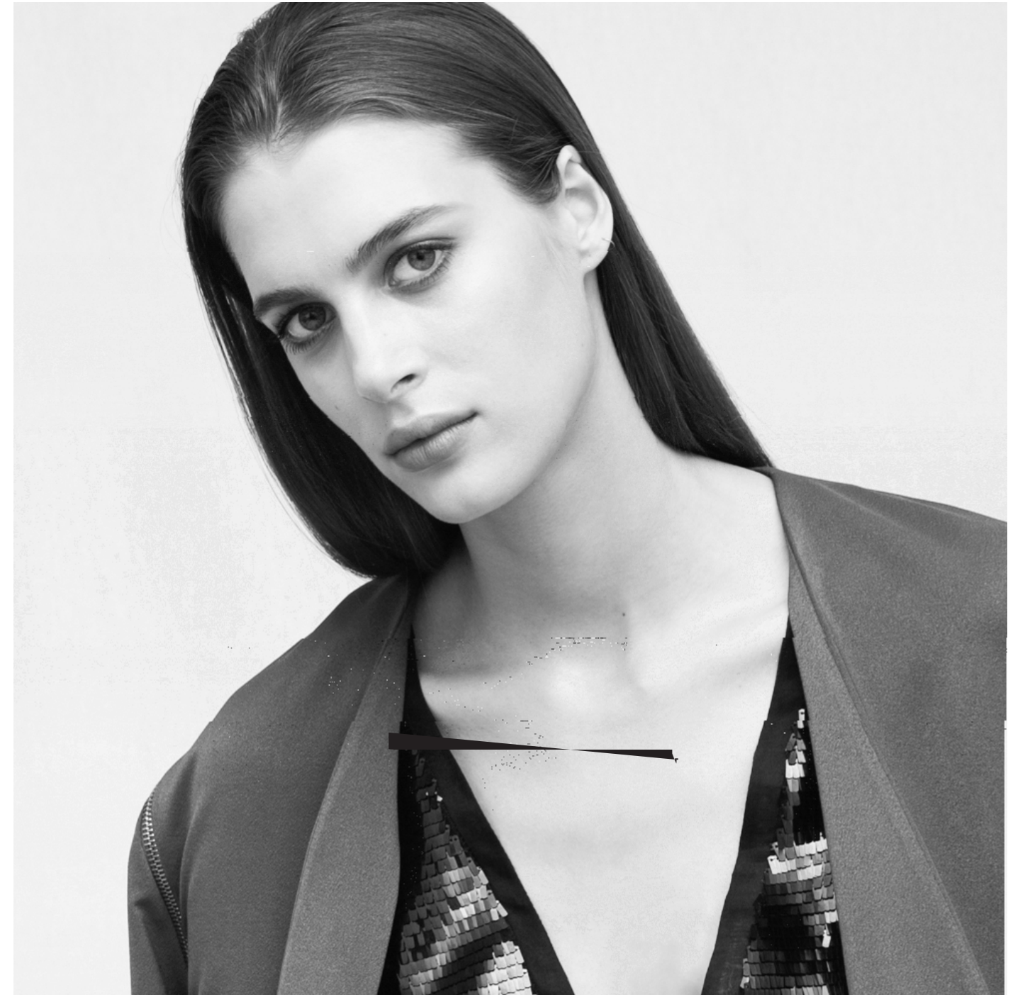
This Page: Jacket WOODHOUSE, Top VICTORIAHAYES Left Page: Dress SHAHISTALANI